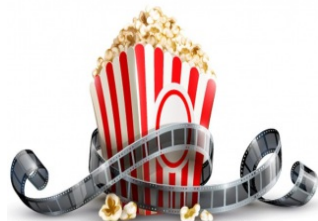
Family Movie Night

Family Movie Nights at St. Matthew The Board of Evangelism & Education will begin sponsoring movie nights here at St. Matthew beginning in June. The board would love to have the congregations feedback and input on what movies you would like to see and whether Friday or Saturday night works best for you. There is a sheet placed in the Narthex were you can submit your vote/opinion.